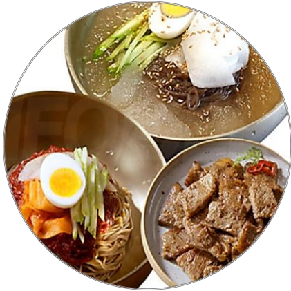
갈비냉면 | GALBI NAENGMYUN

Choice Of Naengmyun (MULL/BIBIM) Served with Grilled Marinated Short Rib