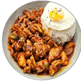
불닭덮밥 | BULDAK DEOPBAP

Rice Bowl Topped with Stir-Fired Spicy Chicken