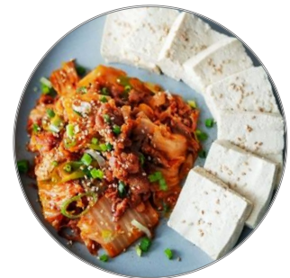
두부김치 | DUBU KIMCHI

Stir-Fried Kimchi Served with Sliced Warm Tofu