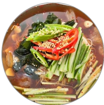
미역오이냉국수 | OIE NAENG GUKSU

Knife-Cut Noodle Served in Hot Broth with Assorted Seafood