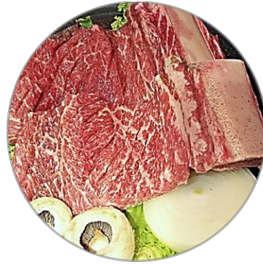
갈비 | GALBI