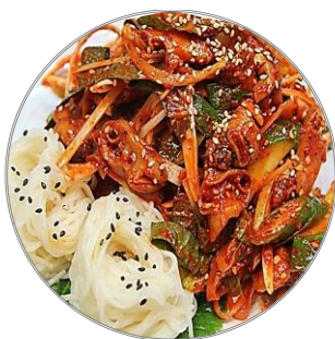
골뱅이무침소면 | GOLBAENGII MUCHIM SOMYUN

Spicy Seasoned Moon Snails Served with Noodles