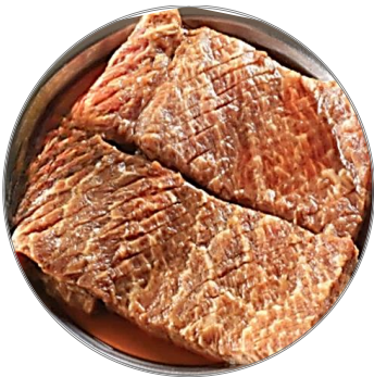
양념갈비 | YANGNYUM GALBI