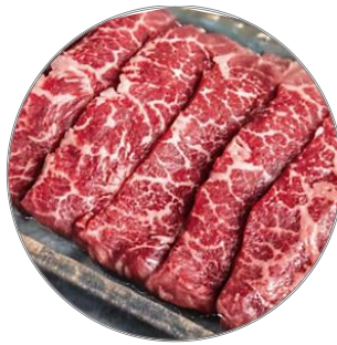
부채살 | BUCHAESAL