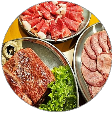
모듬구이 | MODEUM BEEF