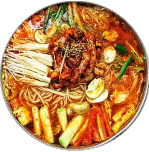
불낙전골 | BULNAK JEONGOL

Beef Bulgogi and Octopus Simmered in A Spicy Broth with Assorted Vegetables