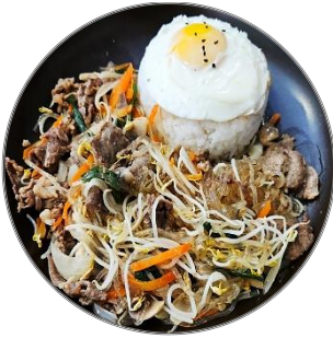
소불고기덮밥 | BULGOGI DEOPBAP

Rice Bowl Topped with Marinated Bulgogi Beef