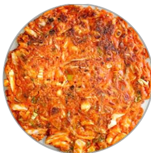
김치전 | KIMCHI JEON