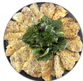
육전 | YUK JEON