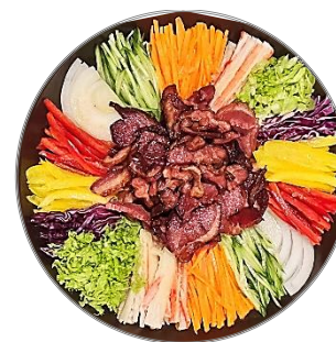
훈제오리냉채 | HOONJAE ORI NAENGCHAE

Smoked Duck Breast Slices and Vegetables in A Spicy Tangy Mustard Sauce