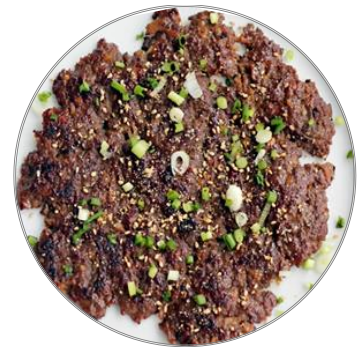
바싹불고기 | BASSAC BULGOGI