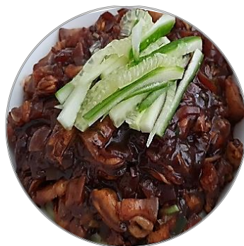
자장면 | JAJANGMYUN