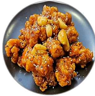
매콤마늘닭강정 | DAK GANG JUNG

Deep-Fried Chicken and Whole Garlic in A Spicy and Sweet Sauce