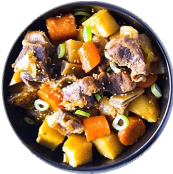
갈비찜 | GALBI JJIM