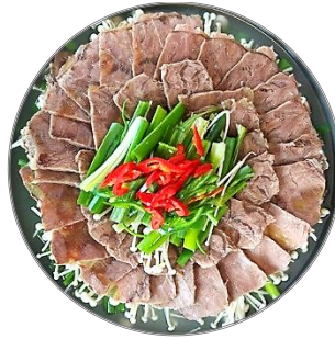
사태수육전골 | SATAE JEONGOL

Tender Boiled Beef Shank Slices Simmered in Rich Broth with Vegetables