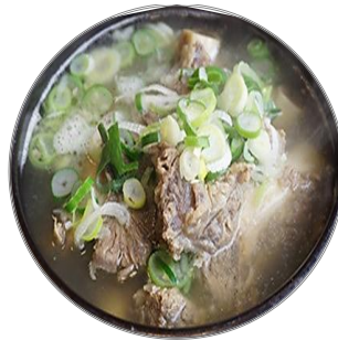
갈비탕 | GALBI TANG

Beef Short Ribs Soup Simmered in A Clear Broth W Vegetables