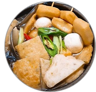
어묵탕 | EOMUK TANG *