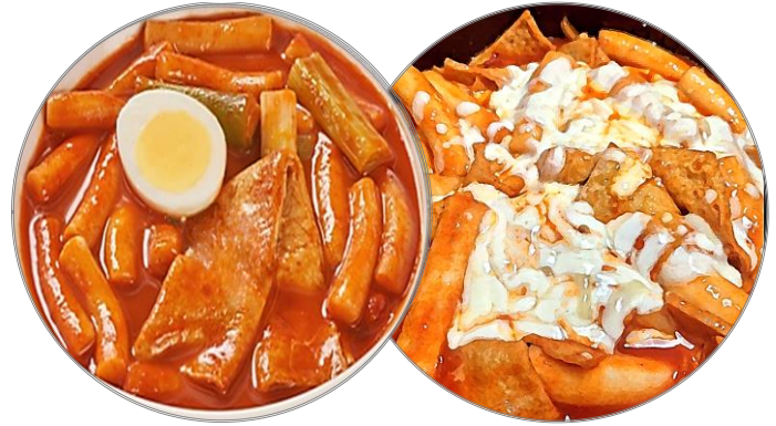
떡볶이 | TTEOKBOKKI 45

Rice Cakes Cooked in A Sweet and Spicy Gochujang