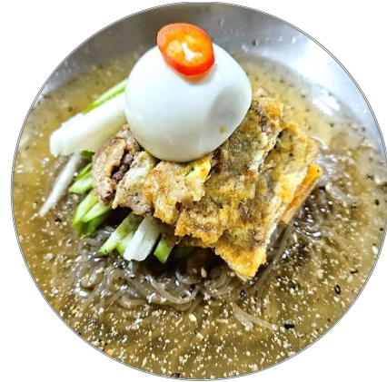
육전냉면 | YUKJEON NAENGMYUN

Choice Of Naengmyun (MULL/BIBIM) Topped with Sliced Beef Pancakes