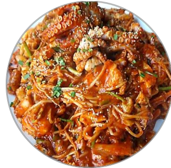
모듬해물찜 | MODEUM HAEMUL JJIM

Assorted Seafood, Include Fish Roe, Shrimp, Clam and Fish, Braised in A Spicy and Savory Sauce