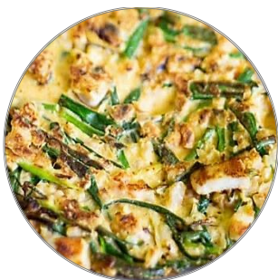
해물파전 | HAEMUL PA JEON