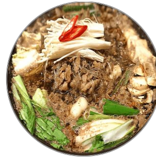
버섯불고기전골 | BEOSEOT BULGOGI JEONGOL

Assorted Mushroom, Bulgogi Beef and Vegetables Simmered in A Flavorful Bulgogi-Style Broth