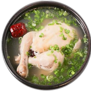
삼계탕 | SAMGYE TANG *

Chicken Soup Made with Whole Young Chicken Stuffed with Rice, Ginseng, Garlic and Other Herbs