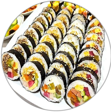
김밥 | GIMBAP 30