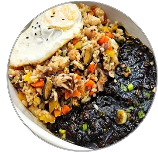
해물볶음짜장밥 | HAEMUL JAJANG BAP

Seafood Fried Rice Bowl Topped with Black Bean Paste Sauce