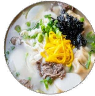
떡만두국 | TTEOK MANDU GUK *

Thinly Sliced Rice Cake Soup Simmered with Egg and Dumpling, And Topped with Beef and Dried Seaweed