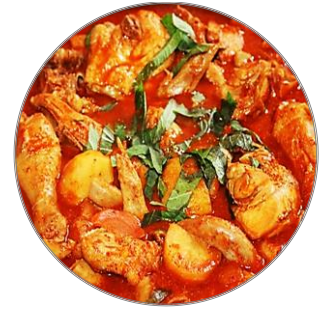
닭도리탕 | DAK DORITANG

Braised Chicken Pieces and Vegetables Simmered in A Red Chili-Based Sauce