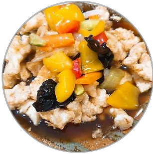
탕수육 | TANGSUYUK

Crispy Deep-Fried Meat in A Sweet and Tangy Sauce with Vegetables