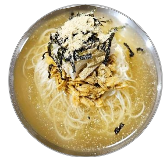
초계국수 | CHOGYE GUKSU

Cold Noodle in Chilled Broth Topped with Shredded Chicken Marinated in Spicy and Tangy Mustard Sauce