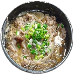
푹배기불고기 | TTUKBAEKI BULGOGI

Marinated Bulgogi Beef Soup in A Savory-Sweet Soy-Based Sauce